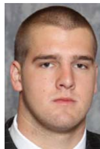
Brewster Ohio State