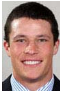
Kuechly Boston College